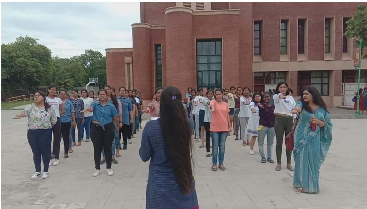
The NSS Students taking the Swachhta pledge

Email Id : jmcadm@yahoo.co.in info@jmc.ac.in principal@jmc.ac.in