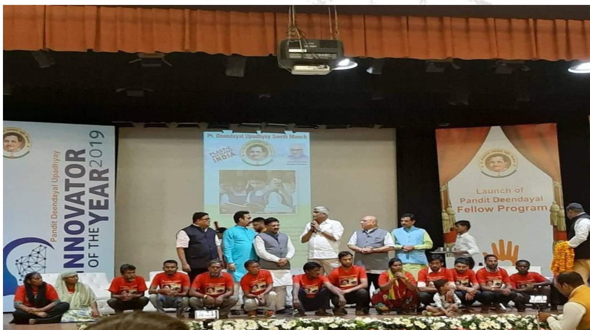
Launch of Pandit Deendayal Fellow Programme