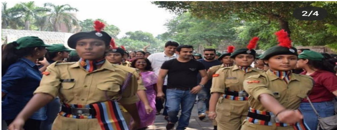
The NCC of JMC welcoming the Chief Guest, Gautam Gambhir