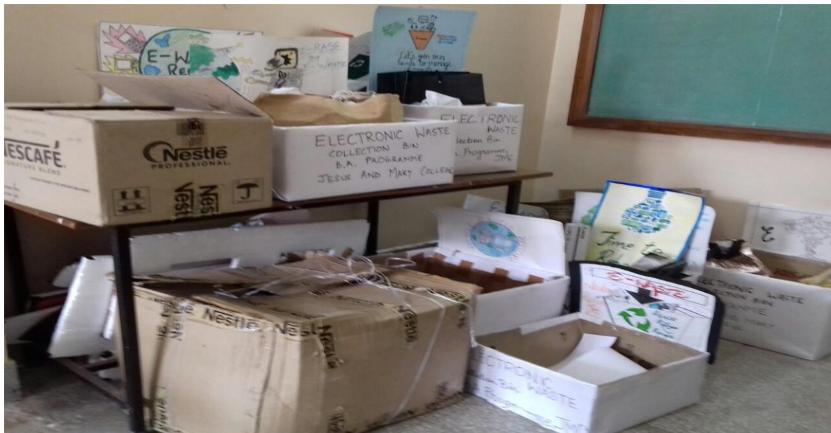
The E-Waste collected during the Campaign

Email Id : jmcadm@yahoo.co.in info@jmc.ac.in principal@jmc.ac.in