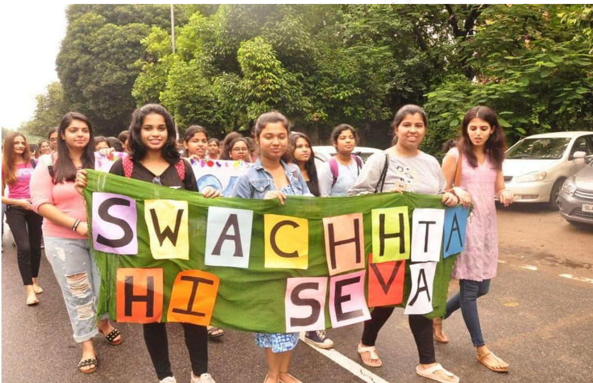
The NSS students at Swachhta Rally