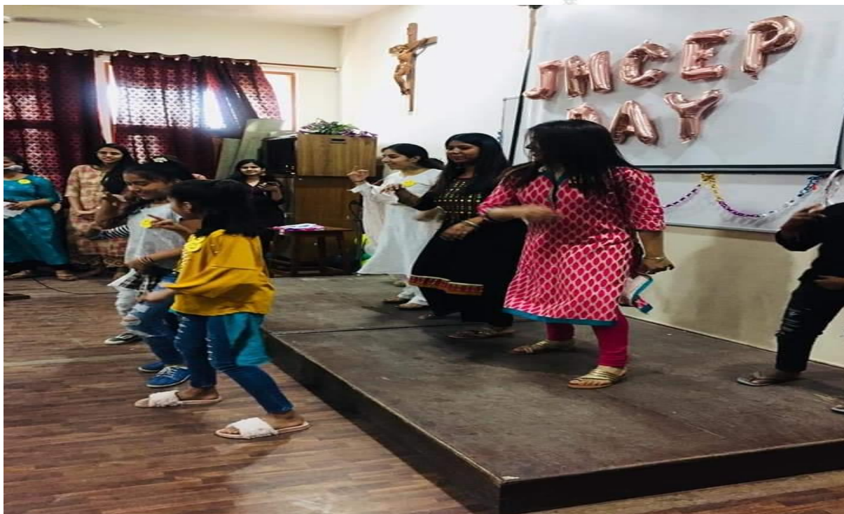
The JMCEP Day Celebrations