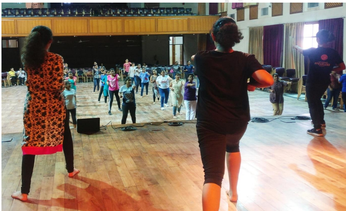
The Self- Defense Workshop in full swing