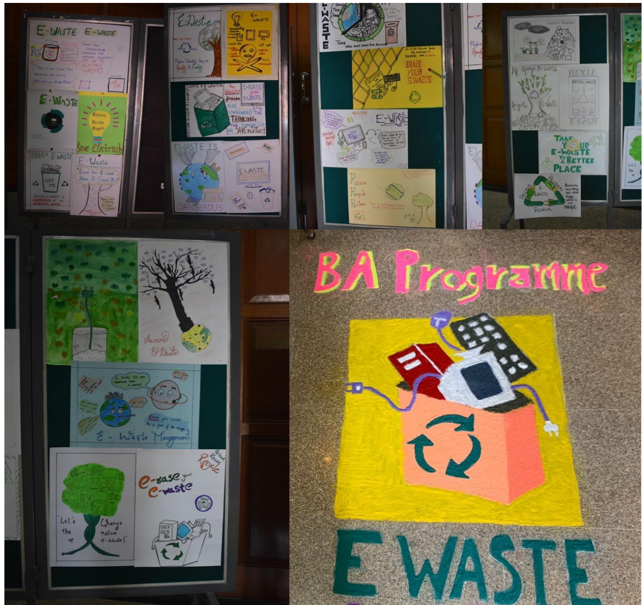
B.A. Programme E-Waste Campaign

Email Id : jmcadm@yahoo.co.in info@jmc.ac.in principal@jmc.ac.in