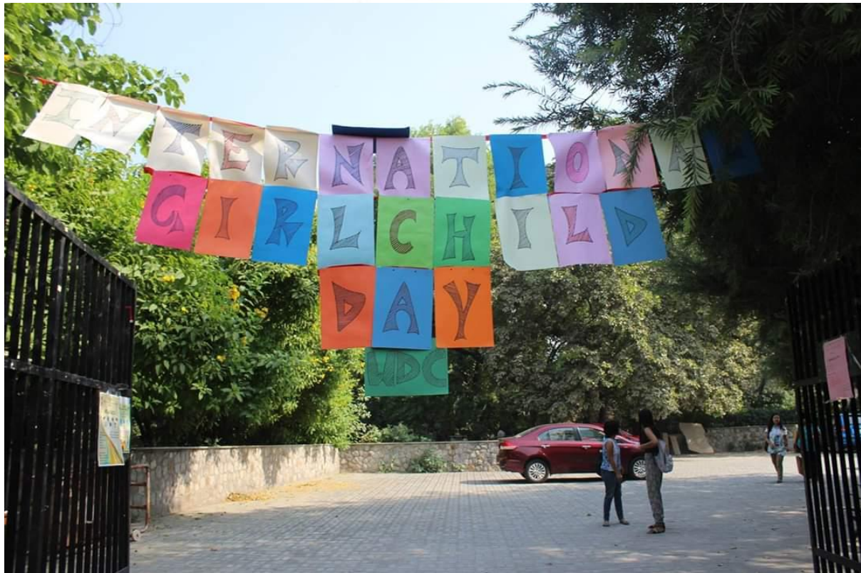
WSC celebrating the International Girl Child Day

Email Id : jmcadm@yahoo.co.in info@jmc.ac.in principal@jmc.ac.in