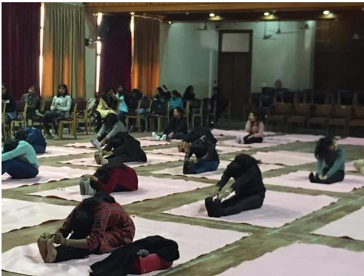
Students trying different Yoga asanas

Email Id : jmcadm@yahoo.co.in info@jmc.ac.in principal@jmc.ac.in