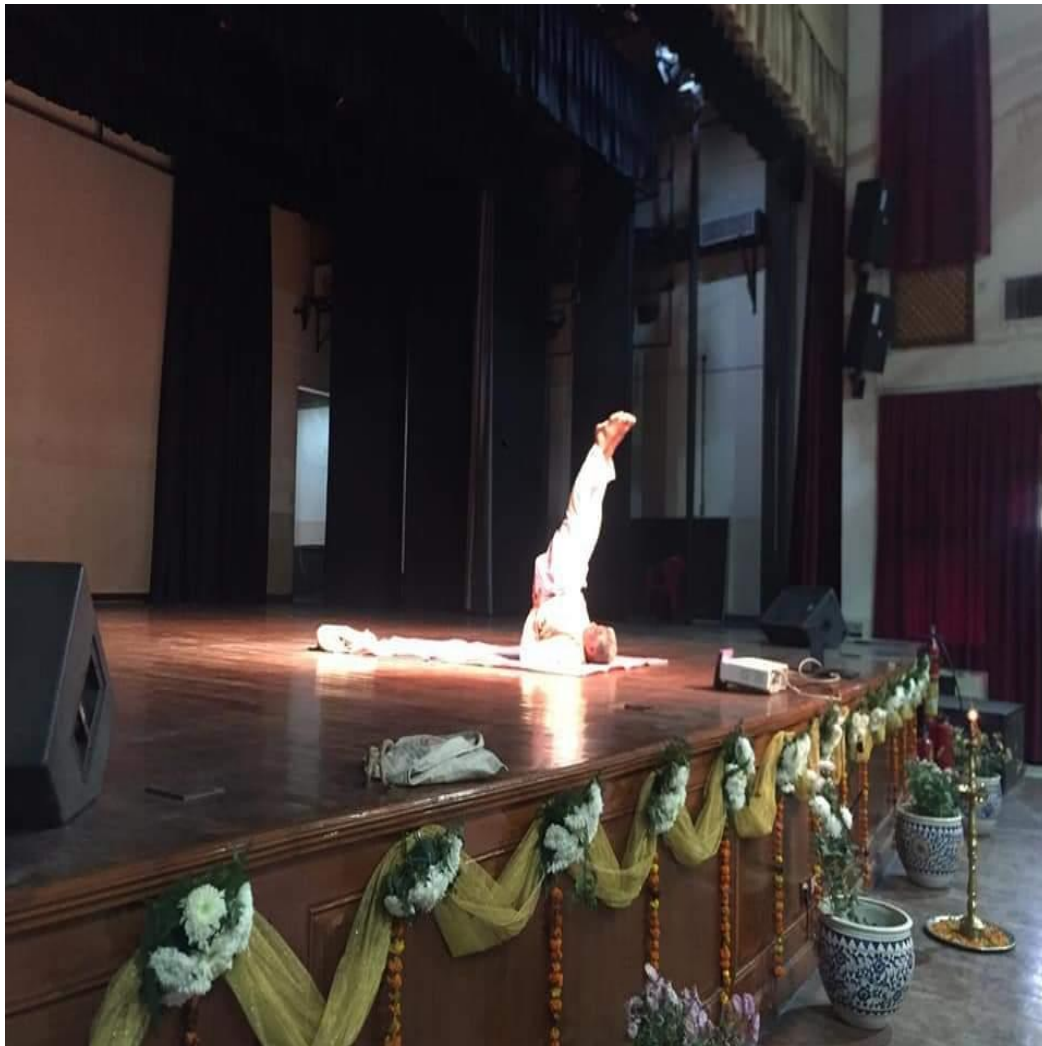
Yoga for Peace Event

The Peace Society of JMC actively works throughout the academic session to organize talks, interactive sessions and poster-making competitions to highlight the importance of inner peace in today's extremely hectic lifestyle when students often feel alienated from their own selves. To mark the 125th anniversary of Swami Vivekanand's Chicago speech, the Peace Society participated in the 2 km World Peace March organized by Vivekanand Youth Connect on 9th September 2018. The Peace Society organized an event titled 'Yoga for Peace' on 21st January 2019. During the annual fest of JMC, the Peace society organized a series of competitions related to the inculcation of values for world peace - slam poetry, photography, slogan writing and poster making competition.