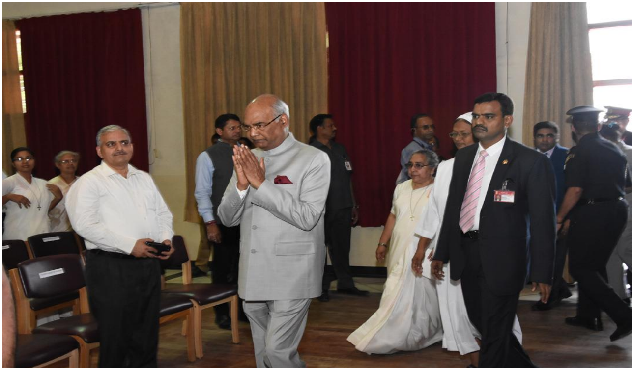
President of India, Ram Nath Kovind at the Inaugural Ceremony of Golden Jubilee Celebrations

The Golden Jubilee Celebrations began with an inaugural function held on 20 th September, 2017 with Hon'ble President of India, Shri Ram Nath Kovind as the Chief Guest. In his speech, he emphasized the importance of educating women in India and lauded the contribution of JMC in higher education for women.