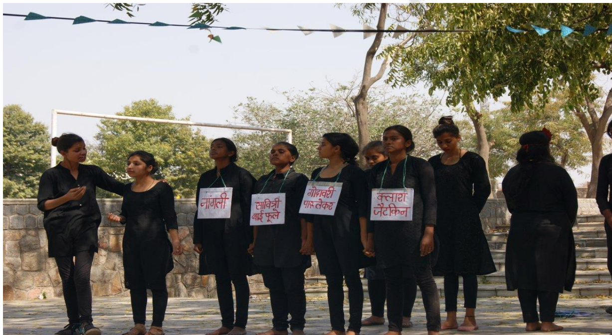
The WSC Members engaged in addressing gender-based issues