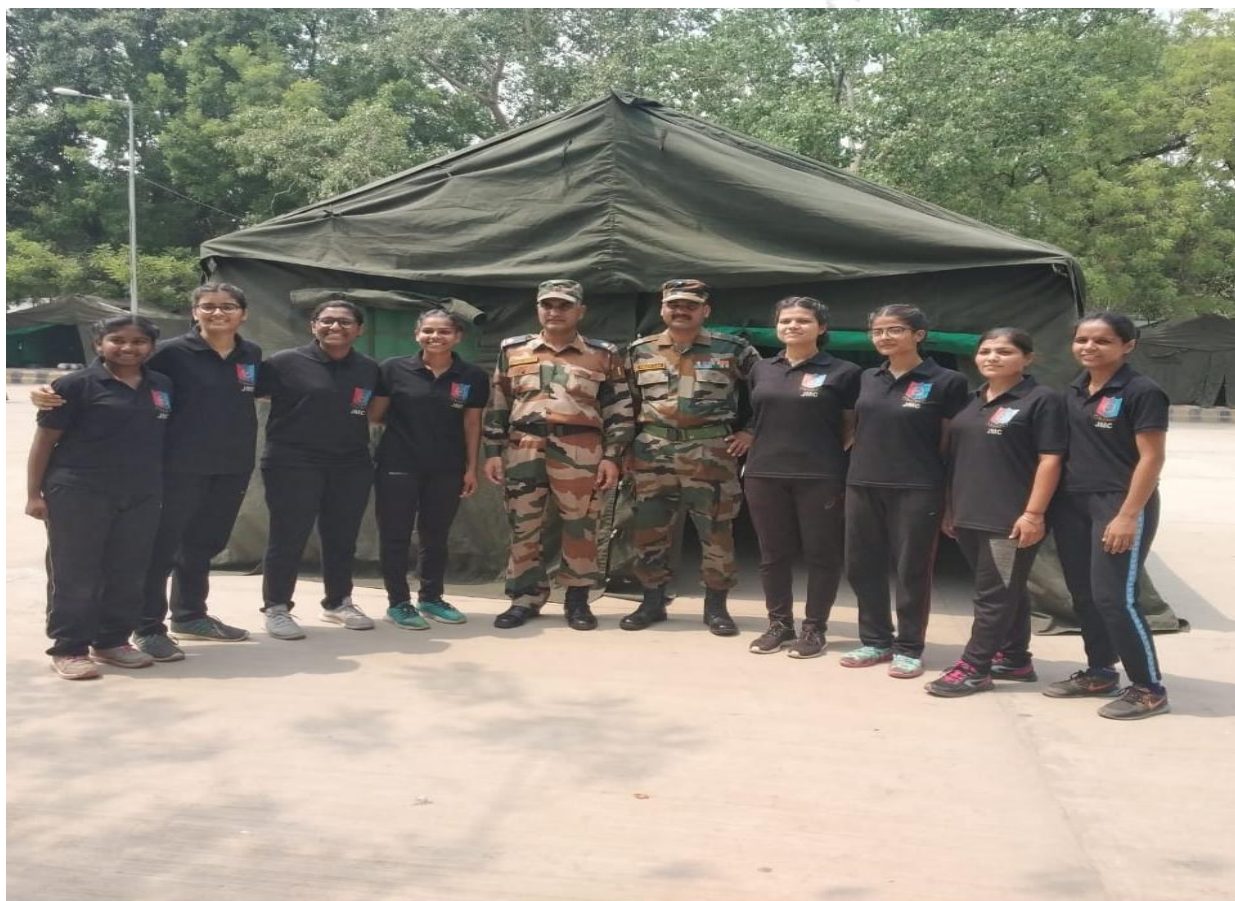
The NCC of JMC in full swing