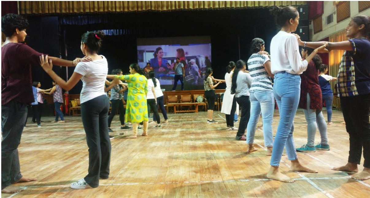
Another glimpse from the Self-Defense Workshop

Email Id : jmcdmn@yahoo.co.in info@jmc.ac.in principal@jmc.ac.in