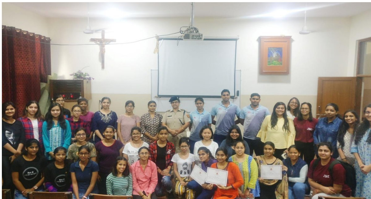
6-day Self-Defense Workshop in September 2018 in collaboration with the Delhi Police to provide basic self-defense physical training.

Email Id : jmcadm@yahoo.co.in info@jmc.ac.in principal@jmc.ac.in