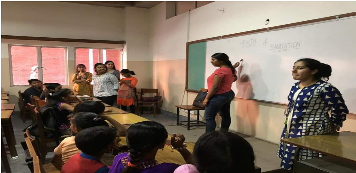
The JMCEP Week Celebrations focusing on the importance of health and sanitation.

Email Id : jmcadm@yahoo.co.in info@jmc.ac.in principal@jmc.ac.in