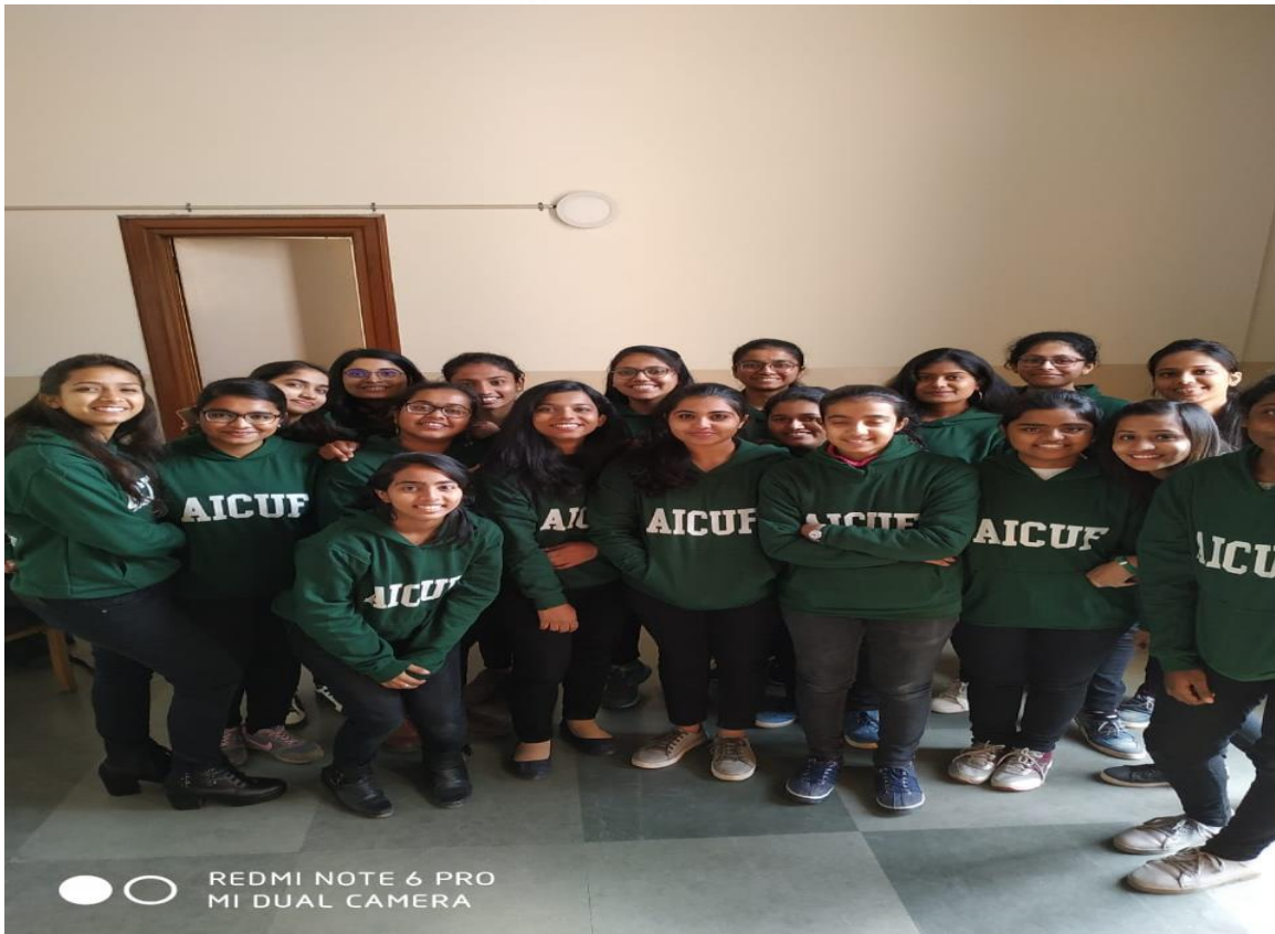
AICUF Student Members

Email Id : jmcdmn@yahoo.co.in info@jmc.ac.in principal@jmc.ac.in